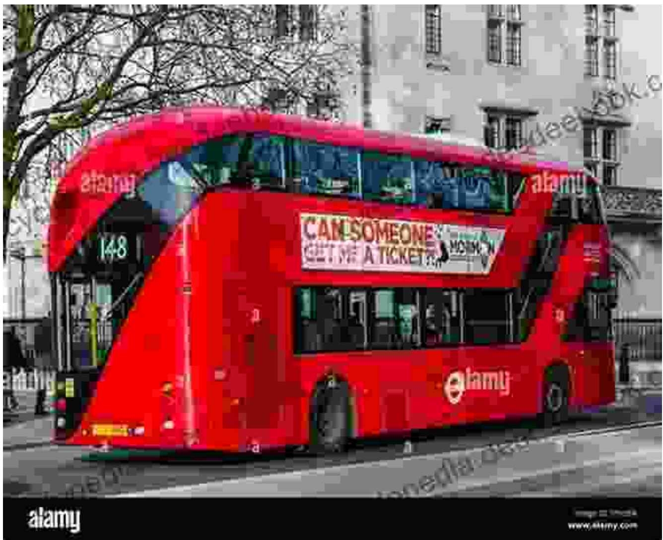
The Number 11 Bus Tour of London by Luigi Farrauto

As the bus completes its journey, returning to the bustling hub of Liverpool Street Station, visitors will undoubtedly depart with a profound appreciation for the vibrant spirit and captivating allure of one of the world's most beloved cities.