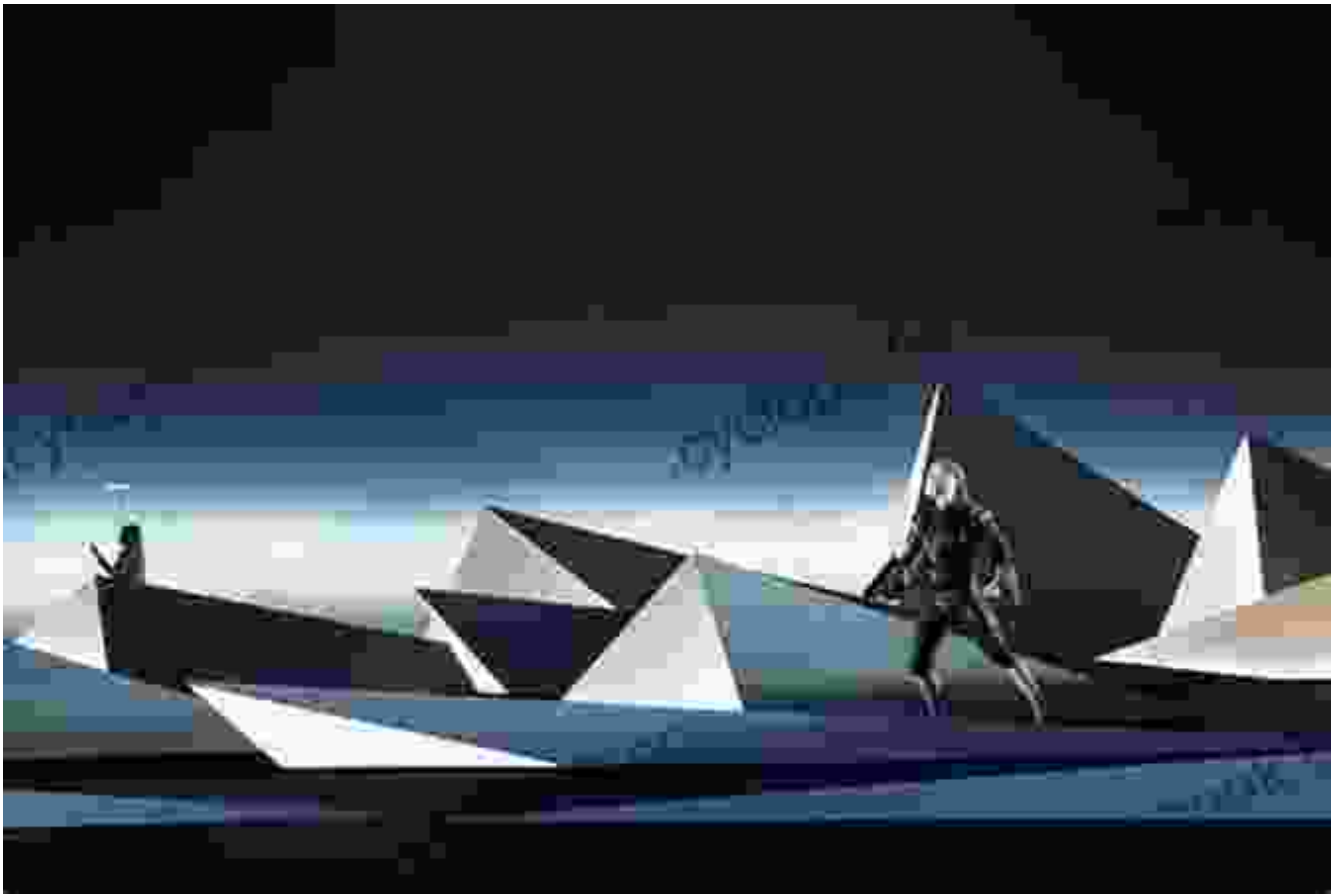
Robert Wilson, Director, Designer, and Visual Artist

Robert Wilson is a visionary theatre artist whose work has been seen all over the world. He is known for his distinctive visual style, which often incorporates elements of surrealism, expressionism, and minimalism. Wilson's work has been praised for its beauty, its theatricality, and its intellectual depth.