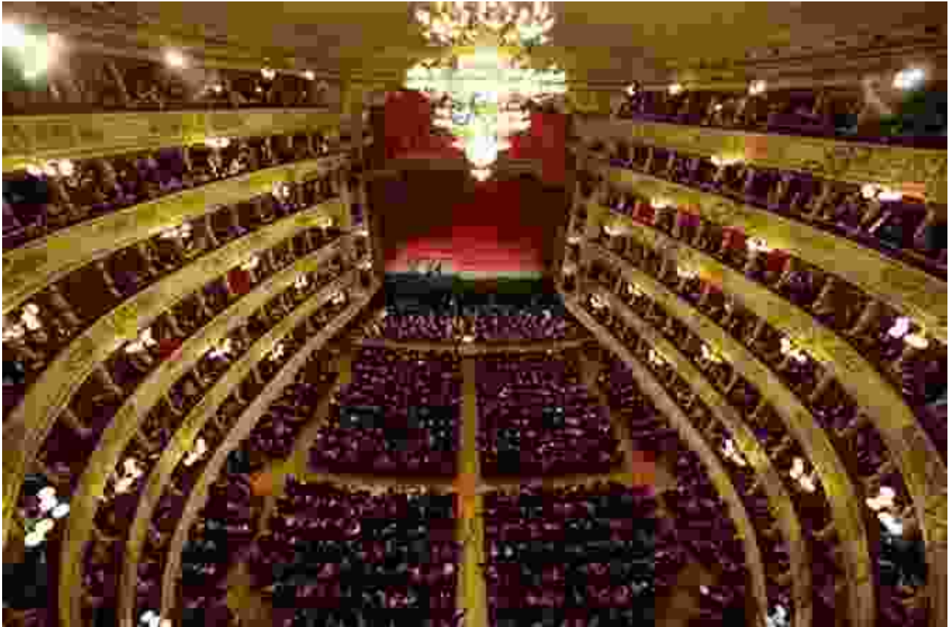
Image Description: The Oro Grand Tier of Teatro alla Scala in Milan, Italy, is an opulent and exclusive horseshoe-shaped balcony with plush velvet seats and intricate ornamentation. It offers breathtaking views of the stage and an intimate and unforgettable opera experience.